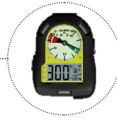
Digital gauge with integrated PASS alarm