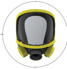
PANO mask with HUD lights and Integrated communication